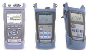
FOT-930 FPM-600 FPM-300